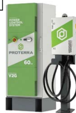
POWER CONTROL SYSTEM CHARGING DISPENSER

HVIP is hosting a free informational workshop Click to attend!